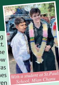
With a student at St. Pauls School, Mian Chanu