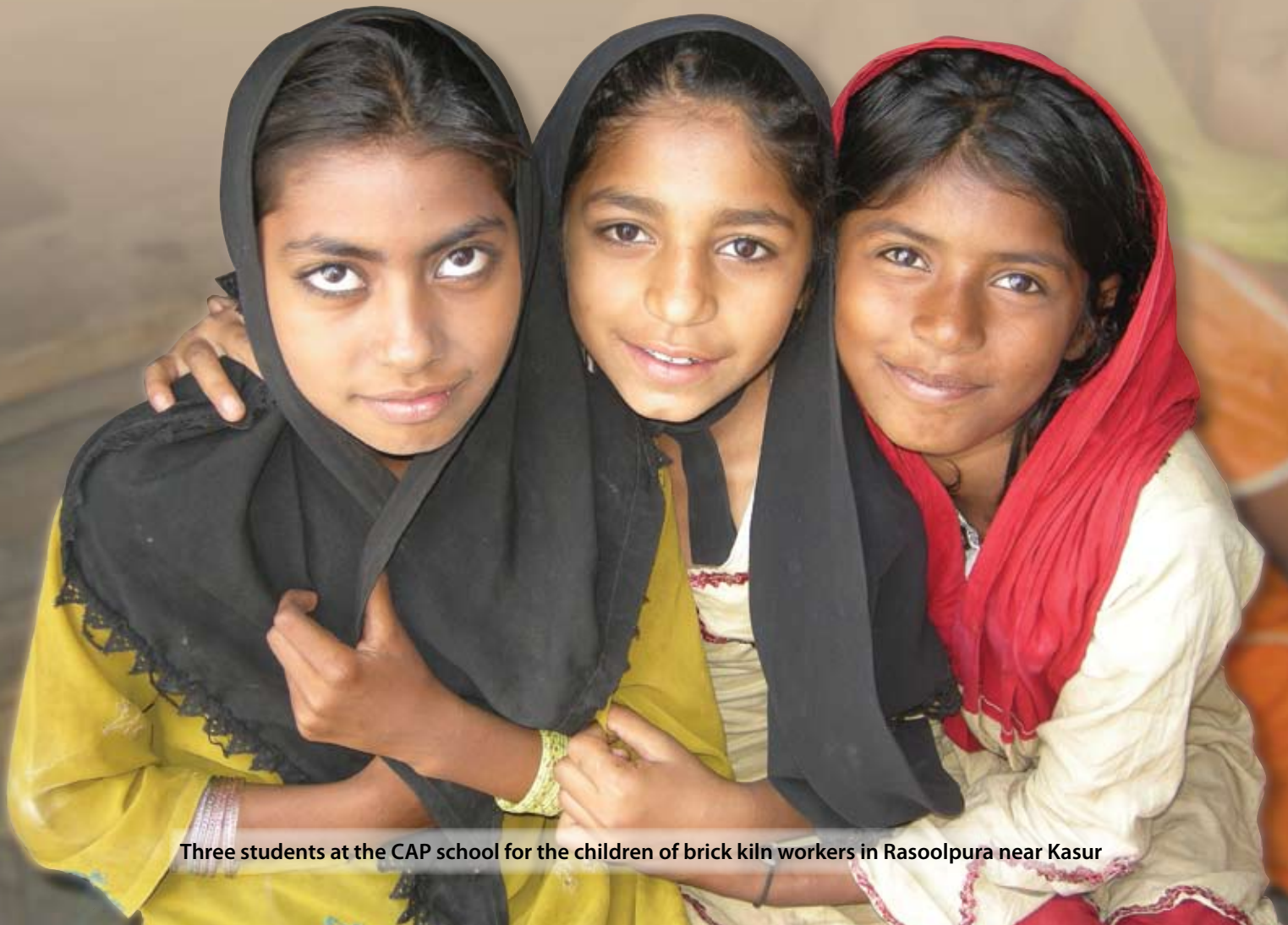
Three students at the CAP school for the children of brick kiln workers in Rasoolpura near Kasur