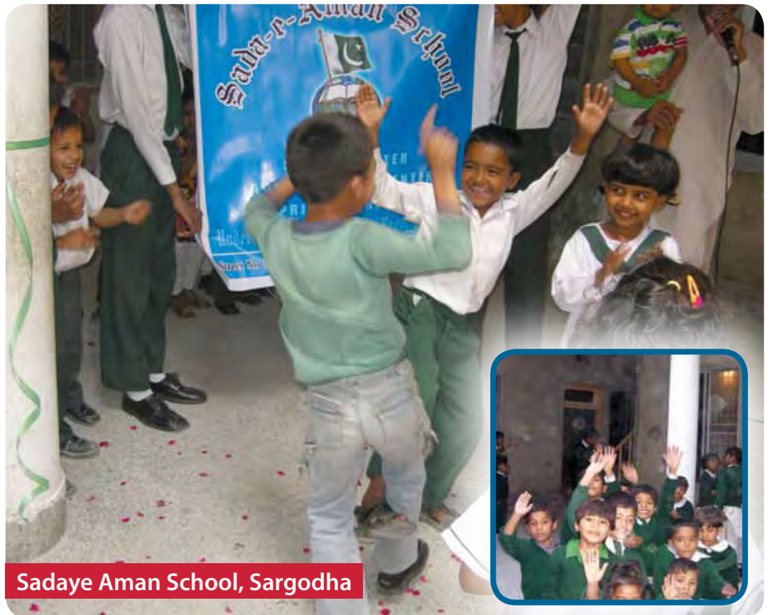
Sadaye Aman School, Sargodha

Thank you for giving the children in Noori Gate a reason to celebrate!